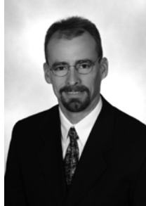
Shook, Hardy & Bacon L.L.P. Kansas City, MO